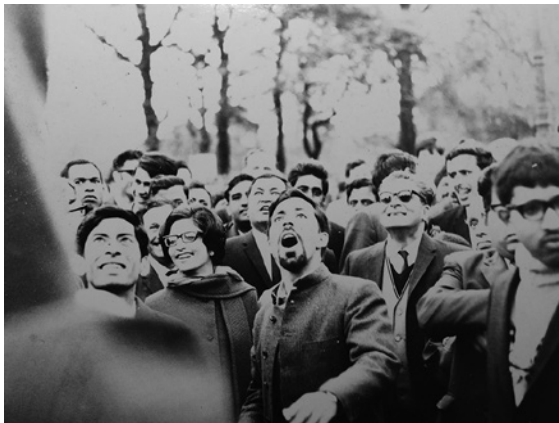
Speakers Corner 1972, by Sheridan Coakley

Very early I clearly realized the pleasures of seeing and song.